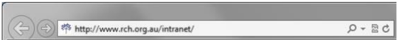
Figure 2, the wrong address

You cannot log in directly from the normal www.rch.org.au site.