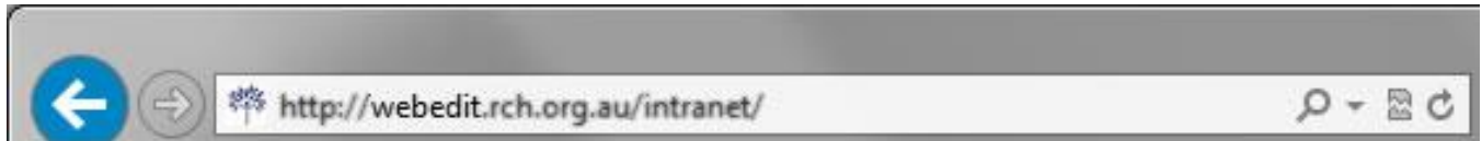
Figure 1, the right address

Before you login, make sure you are on the internal " webedit.rch.org.au " site.