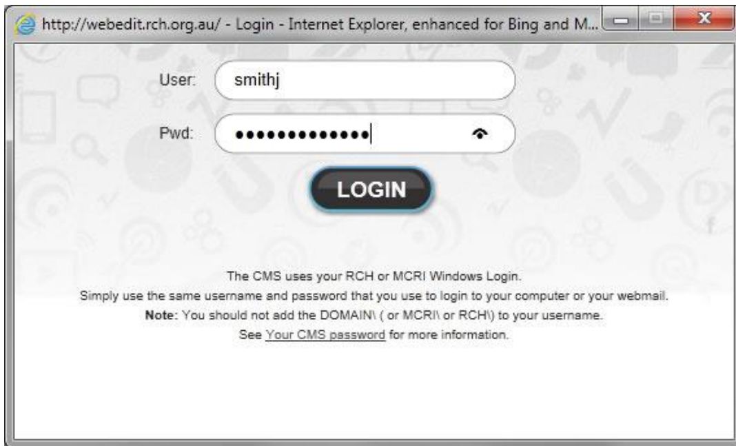
Figure 5, the login screen

You need to type your normal Windows user name and password here. This is the same detail you use to log in to any RCH computer, or access your webmail.